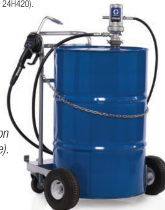
Package 24H775 installed on a 55 gallon drum (not included in package).

*CE packages include 2-way vented valve (BSP: 125041 / NPT: 110223) and air regulator (BSP: 24H419 / NPT: 24H420).