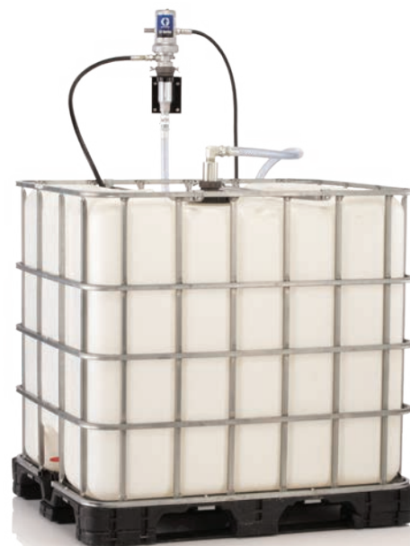
Package 24H842 installed on a 275 gallon tote (not included in package).

*CE packages include 2-way vented valve (BSP: 125041 / NPT: 110223) and air regulator (BSP: 24H419 / NPT: 24H420).